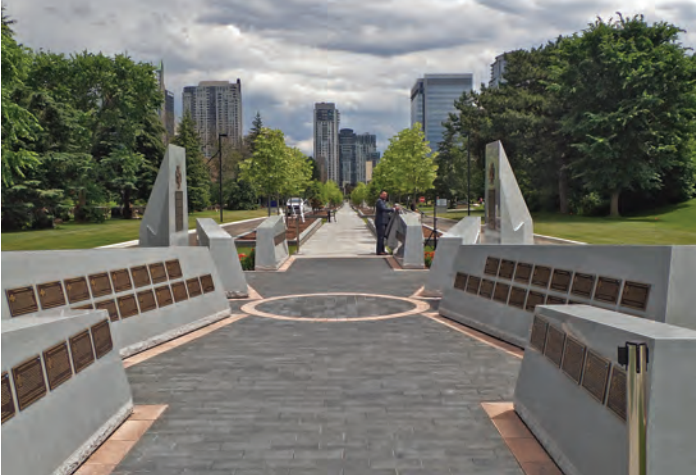
On June 25, York Cemetery held a unique celebration to dedicate the only memorial in Canada to honour all 99 of Canada's Victoria Cross recipients and also officially open a new pedestrian boulevard, through the cemetery.