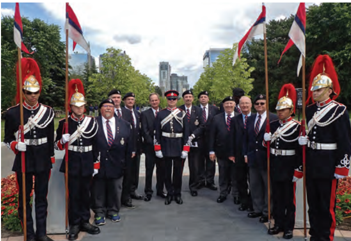
In attendance were both serving and Veteran members of the Governor General's Horse Guards (including the Cavalry Squadron), and members of the Royal Canadian Legion, Branch 66.