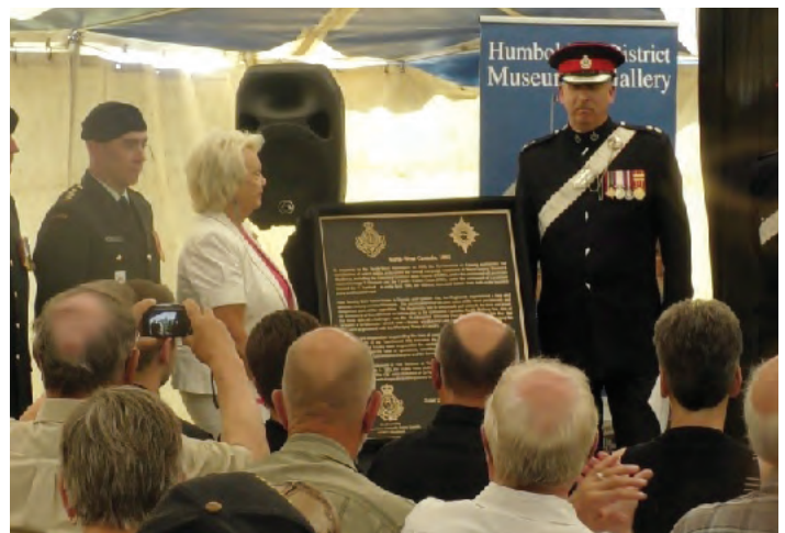
Through the efforts of the GGHG Historical Society, the unveiling of the a joint plaque (with the RCD) commemorated our participation in the Northwest Resistance. Among the dignitaries present was the Lt. Governor of Saskatchewan.