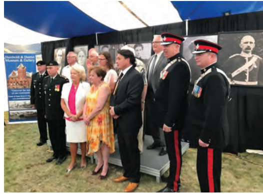
Among those present for the unveiling of the Northwest Canada Battle Honour plaque, were the Lt Governor of Saskatchewan and representatives from the RCD.