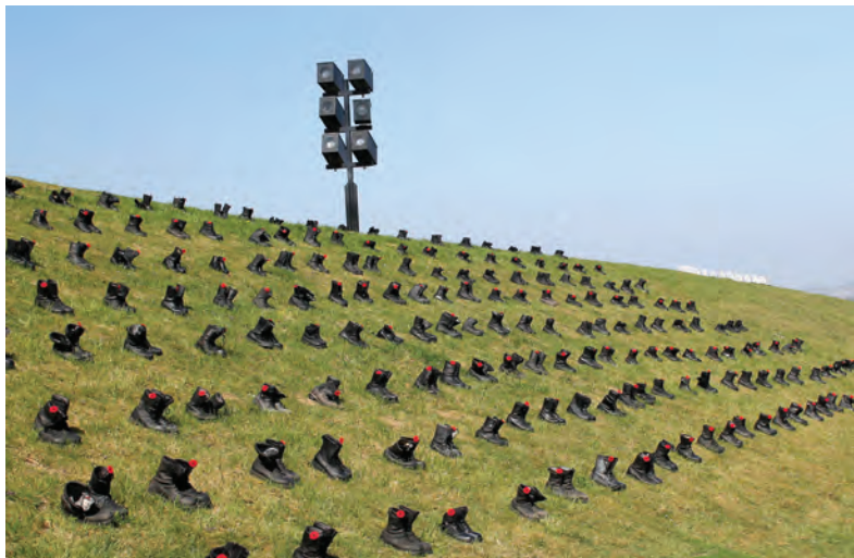
The empty boots on the hillside during the ceremony were a poignant reminder of the price Canadians paid in the Battle of Vimy Ridge.

Accompanying the Veterans were the Minister of Veteran Affairs, the Deputy Minister, several Senator's and Members of Parliament from all parties. I was seated at one luncheon with a Senator on one side and an MP on the other and we all had to be on our