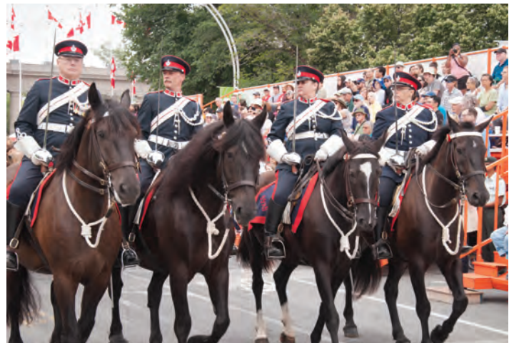
The best indicator that the parade has begun, is when the GGHG Cavalry Unit comes through the Princes' Gates.