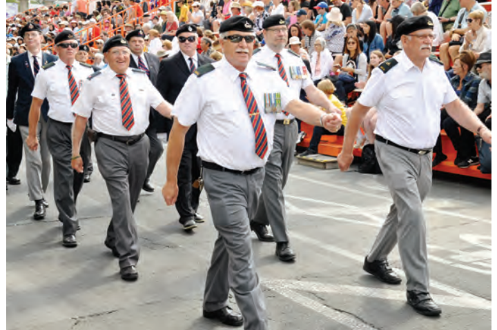
A combined troop from the RCD and GGHG Associations maintain the long tradition of an armoured presence in this annual parade.