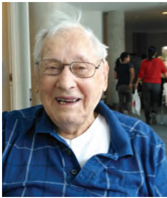
Now a happy resident at the Sunnybrook Veterans Centre.