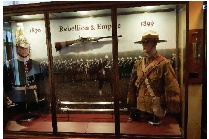
The showcase of historic displays in the GGHG Museum is nearing completion and is located in the Ante-Room of the Warrant Officers and Sergeants' Mess.