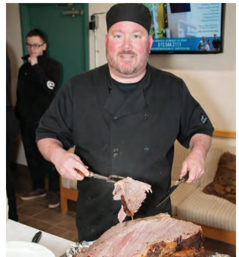
The post-tournament banquet is always the highlight of Ironsides and as always, the Chef did not disappoint us.