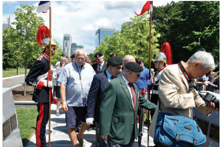
Following the ceremony, members of the public took the opportunity to have a closer look at the memorial plaques. The design of the memorial is such, that when viewed from above, resembles a stylized Maple Leaf.