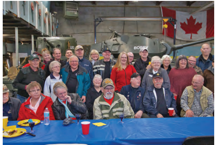
Here's a moment when everyone wanted to be a Horse Guard at this year's Black Hat Barbecue. The fantastic turnout is a good indicator of how successful this annual gathering has become.